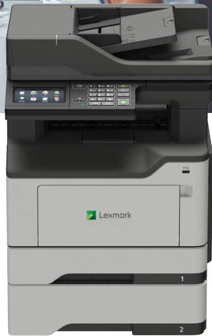
XM1242 with optional tray