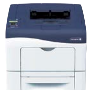
DocuPrint CP405 d