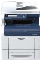
DocuPrint CM405 df