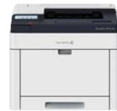
DocuPrint CP315 dw