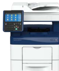
DocuPrint CM415 AP